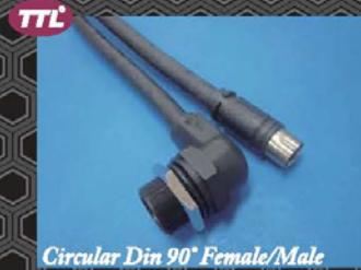
Circular Din 90° Female/Male