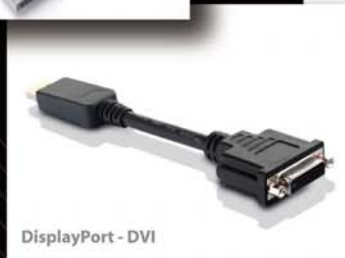
DisplayPort - DVI