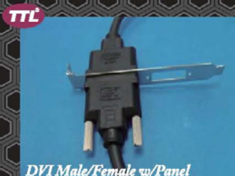
DVI Male/Female w/Panel