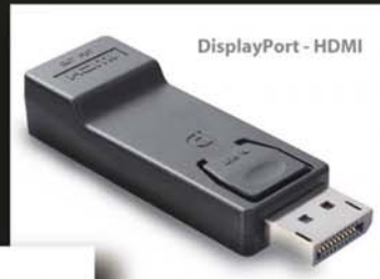
DisplayPort - HDMI