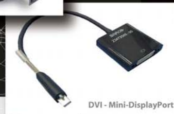
DVI - Mini-DisplayPort