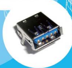
Standard A to Standard A