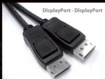
DisplayPort - DisplayPort

The deepest color depths. Powered connectors.