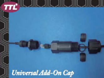
Universal Add-On Cap