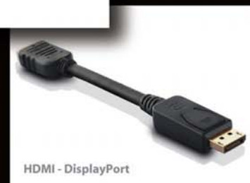
HDMI - DisplayPort

Mini-DisplayPort . VGA . DVI . HDMI . DisplayPort