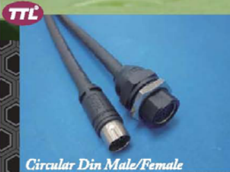
Circular Din Male/Female