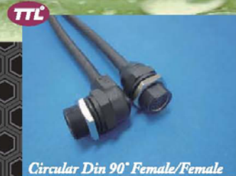
Circular Din 90° Female/Female