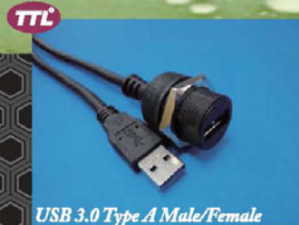
USB 3.0 Type A Male/Female