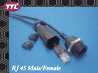
RJ 45 Male/Female