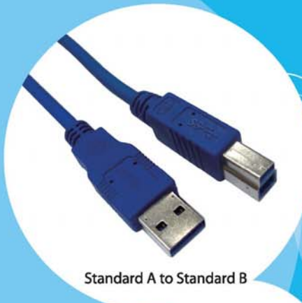
Standard A to Standard B