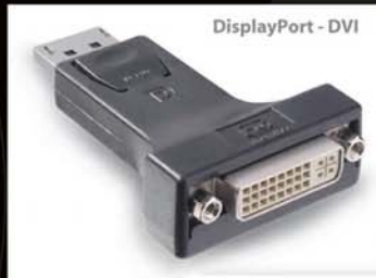
DisplayPort - DVI