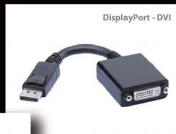
DisplayPort - DVI