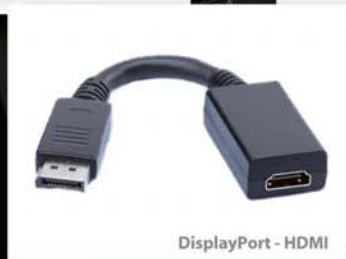
DisplayPort - HDMI