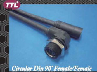
Circular Din 90° Female/Female