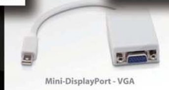
Mini-DisplayPort - VGA

Next Generation Digital Display technology