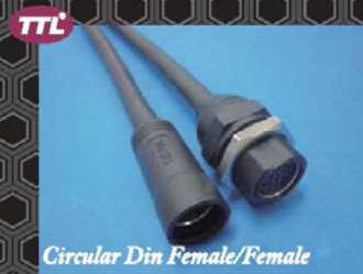
Circular Din Female/Female