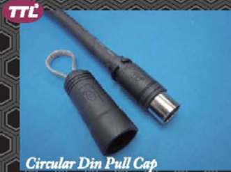
Circular Din Pull Cap