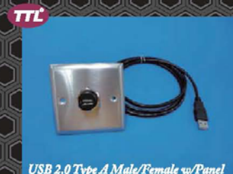
USB 2.0 Type A Male/Female w/Panel