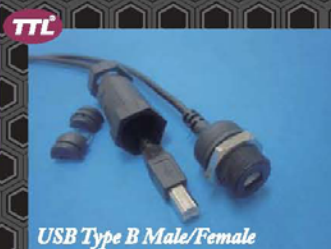
USB Type B Male/Female